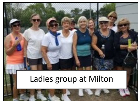
Ladies group at Milton